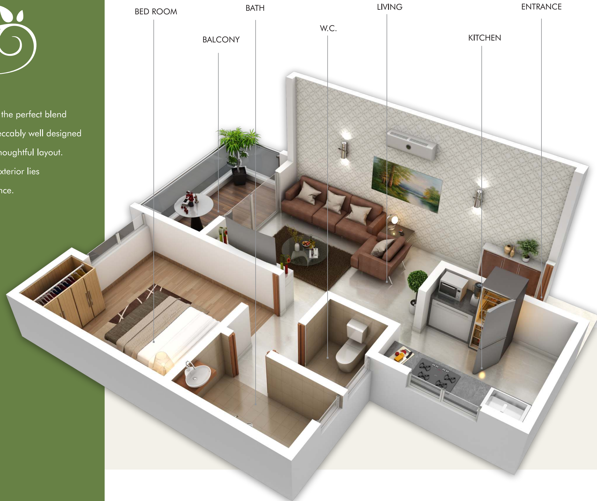
1BHK CUT SECTION

TWILIGHT TERRACE offers the perfect blend of culture and modernity. Impeccably well designed spaces add value to the thoughtful layout. Beyond the sturdy exterior lies the real essence.